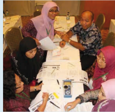
>> Participants in the North Sumatra workshop receive training in a quantitative mobile testing device.