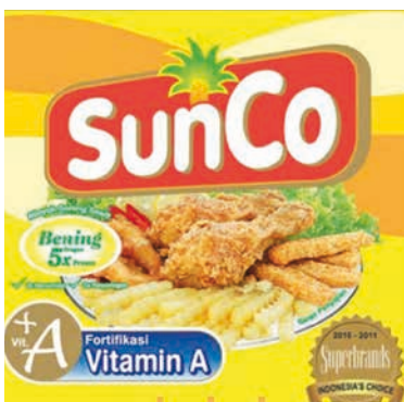
>> Recipient of Indonesia's 2010 'Superbrand' award: cooking oil fortified with vitamin A.

In 2009, the Indonesian National Planning Board set up a steering committee and an implementation committee for fortification of cooking oil with vitamin A. Committee membership included representatives from various government units that worked with KFI. In the same year, a five-year strategy was announced, with the goal of reaching more than 200 million Indonesians with fortified cooking oil. Ultimately, it is intended that vitamin A fortification will be mandatory, based on a national standard issued by the National Standardization Agency and monitored by the Indonesian Food and Drug Board (BPOM).