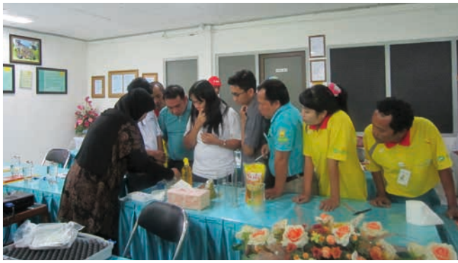
>> SAFO-supported training workshop at a major oil mill in 2011